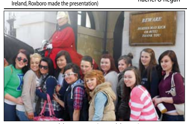
Transition Year students visit London