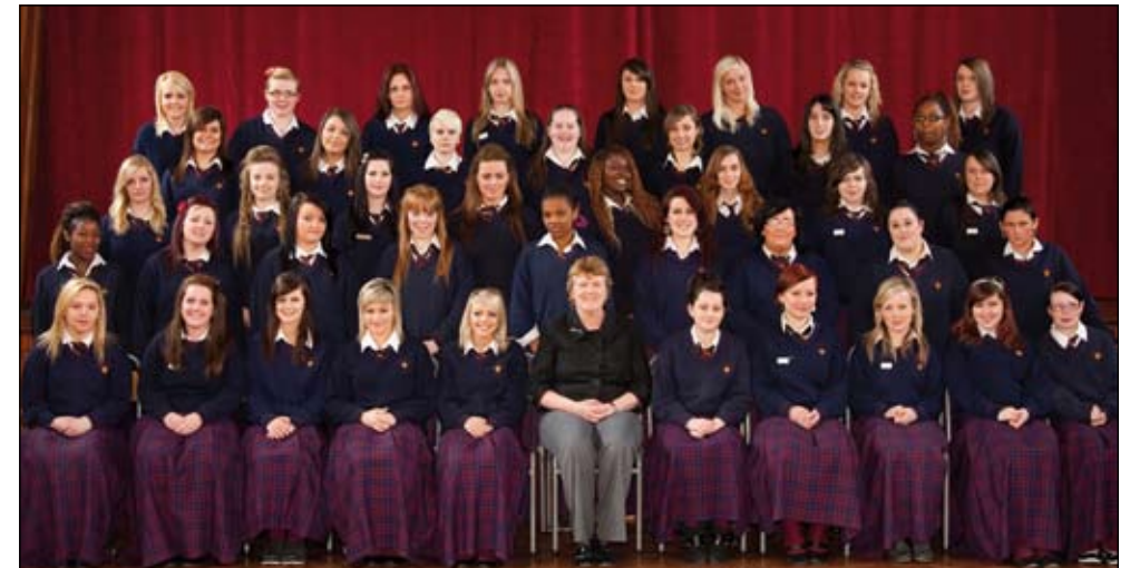
We wish all our Leaving Certificate Class 2012 the very best of luck in their exams. Every good wish for their future careers.